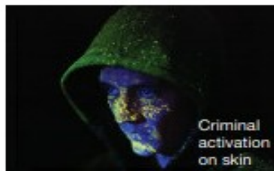
Criminal activation on skin